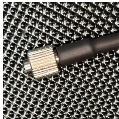
1/4-28UNF 4 pin socket

Other cable lengths are available, please discuss with us.